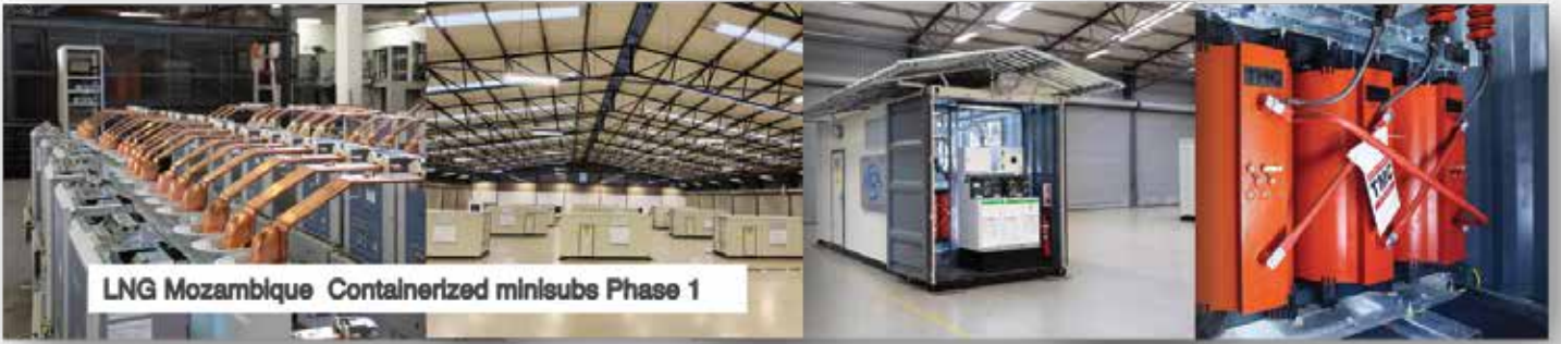
LNG Mozambique Containerized minisubs Phase 1