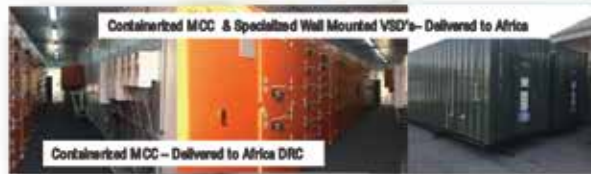
Containerized MCC & Specialised Wall Mounted VSD's - Delivered to Africa