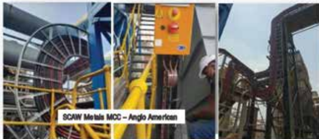
SCAW Metals MCC - Anglo American