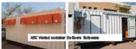
ARC Vented container De Beers Botswana