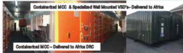
Containerized MCC & Specialised Wall Mounted VSD's - Delivered to Africa