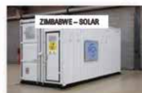
ZIMBABWE - SOLAR