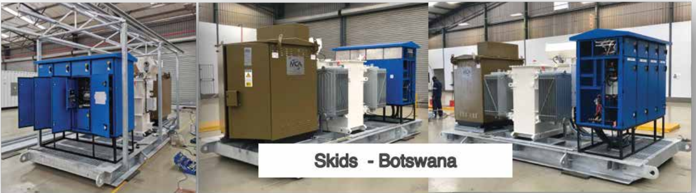
Skids - Botswana