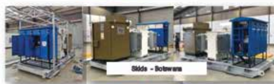
Siids - Botswana