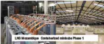
LNG Mozambique Containerized minibus Phase 1