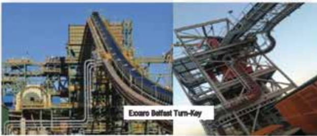
Exaro Belfast Turn-Key