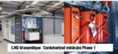
LNG Mozambique Containerized minibus Phase 1