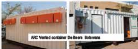
ARC Vented container De Beers Botswana