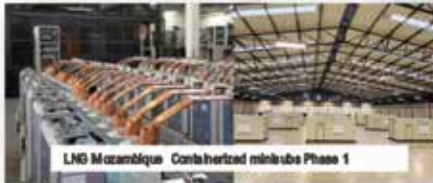
LNG Mozambique Containerized minibus Phase 1